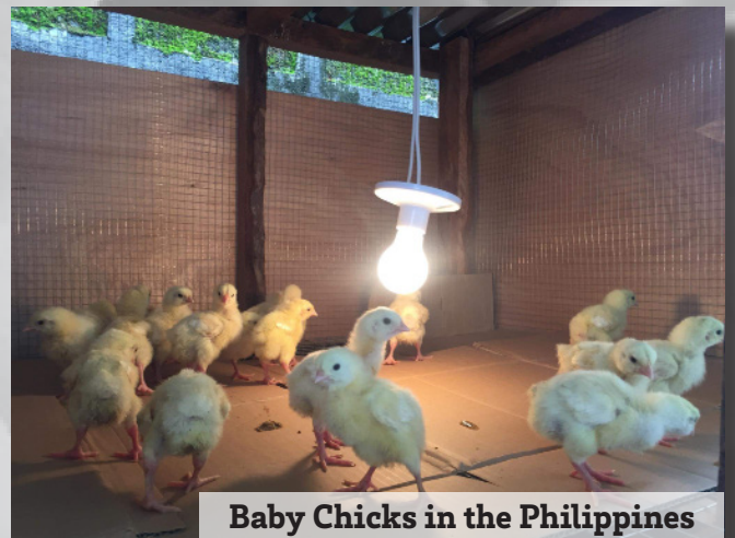
Baby Chicks in the Philippines