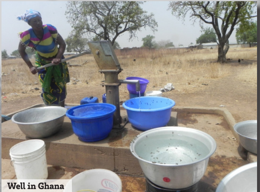
Well in Ghana

25 Community Development Projects in 15 Nations