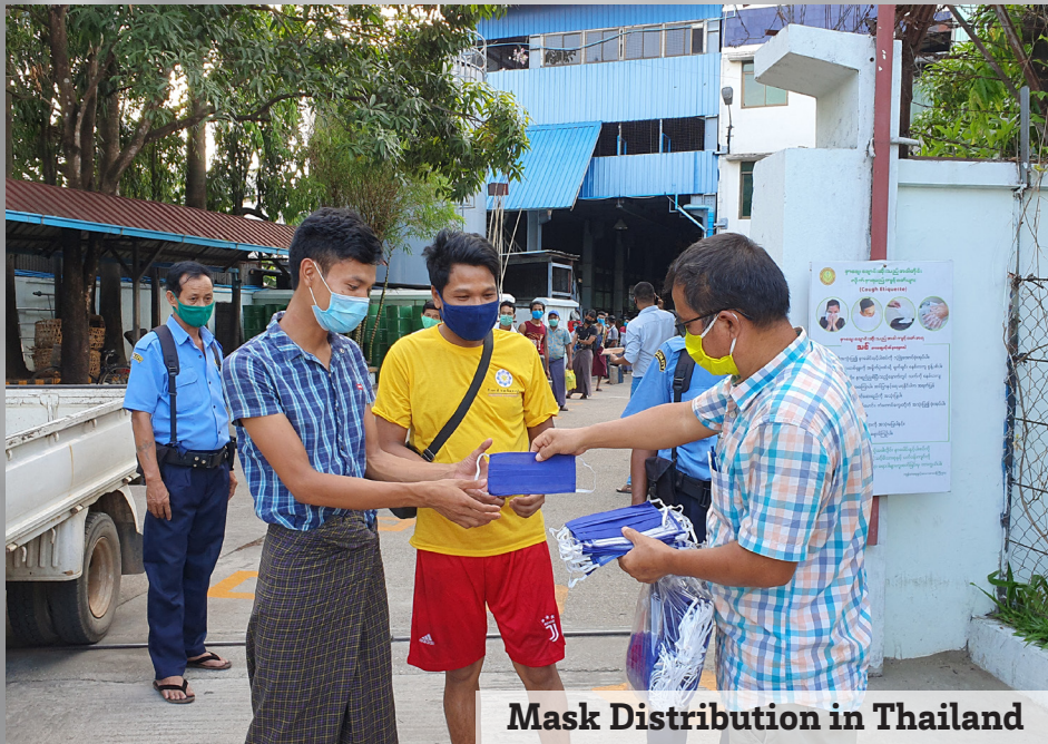
Mask Distribution in Thailand