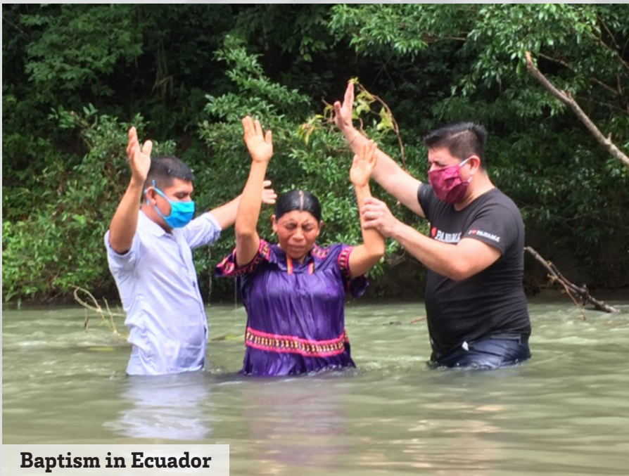
Baptism in Ecuador