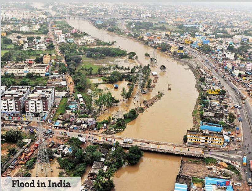
Flood in India

179 Disaster Response Projects in 30 Nations