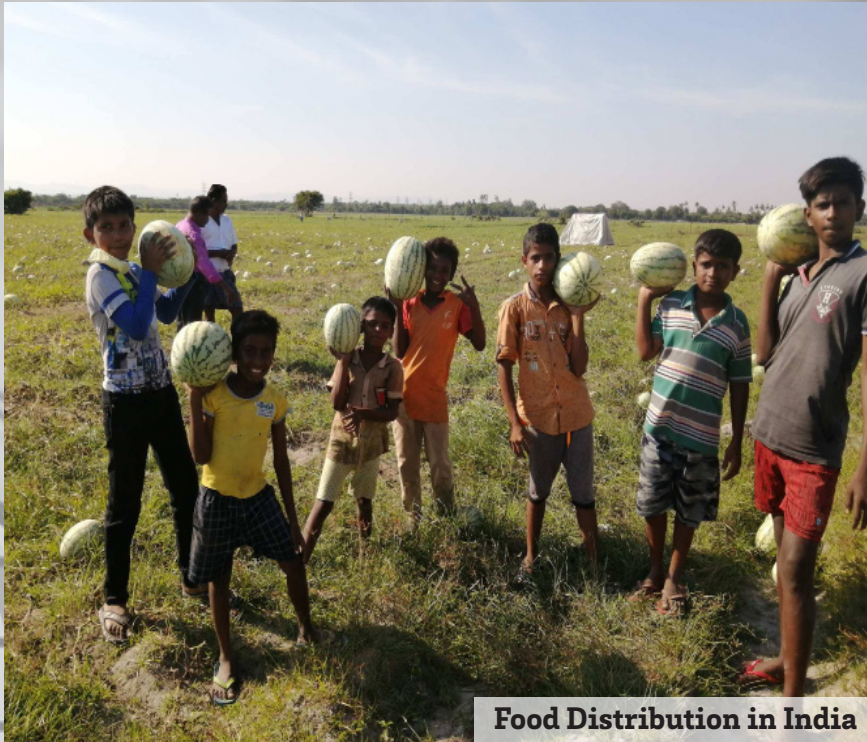
Food Distribution in India