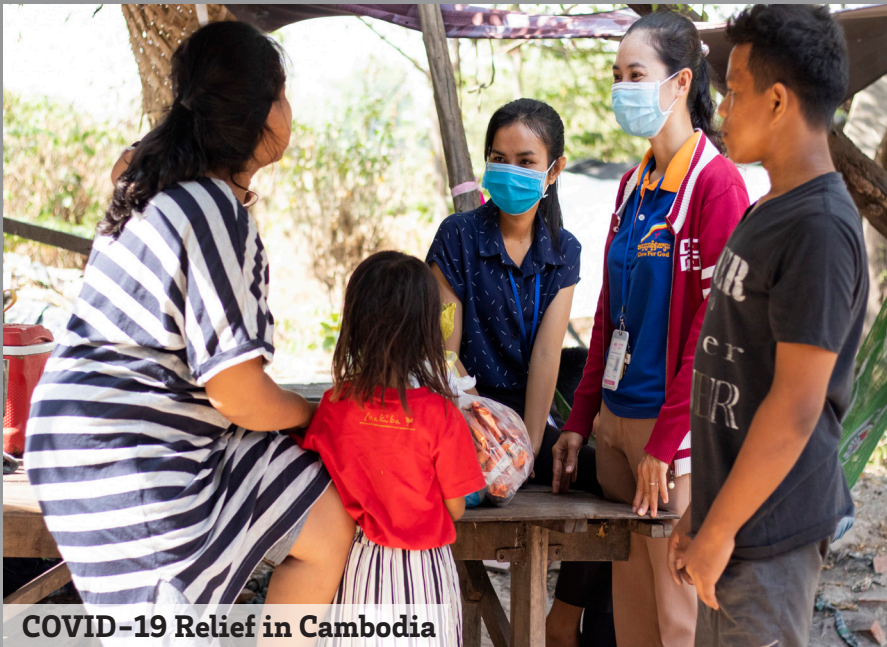
COVID-19 Relief in Cambodia