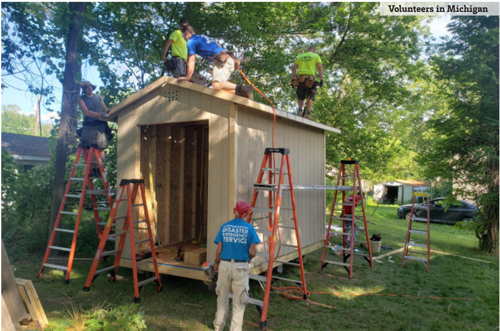
Volunteers in Michigan

International Disaster Emergency Service PO Box 379 Noblesville, IN 46061-0379 Temporary Return Service Requested