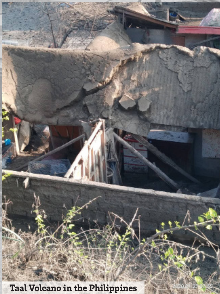
Taal Volcano in the Philippines