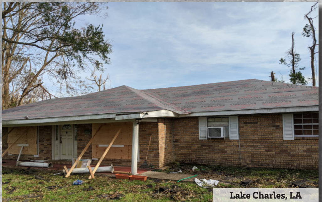
Lake Charles, LA

246 Families Assisted in U.S. Deployments