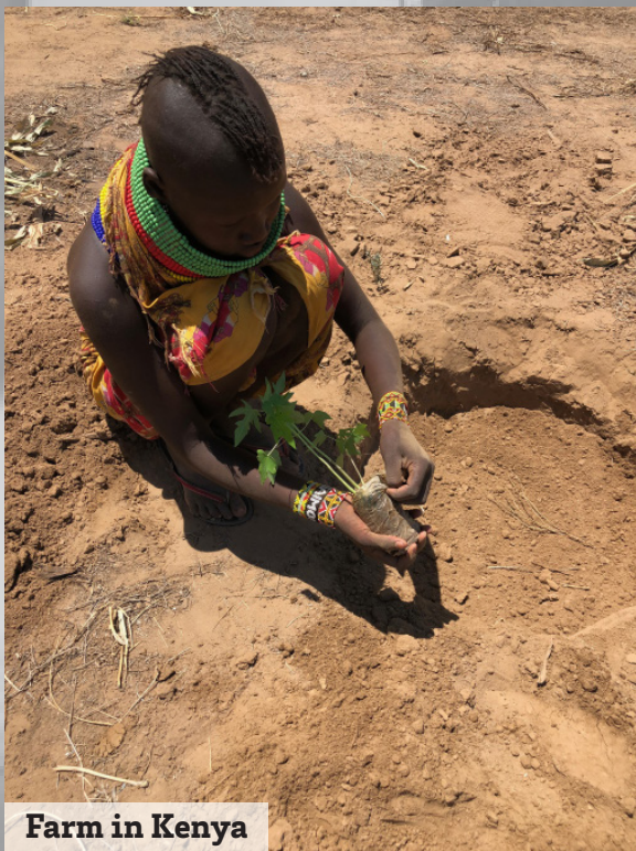
Farm in Kenya

25 Community Development Projects in 15 Nations