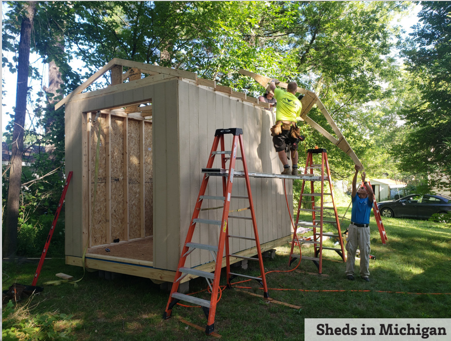
Sheds in Michigan

246 Families Assisted in U.S. Deployments