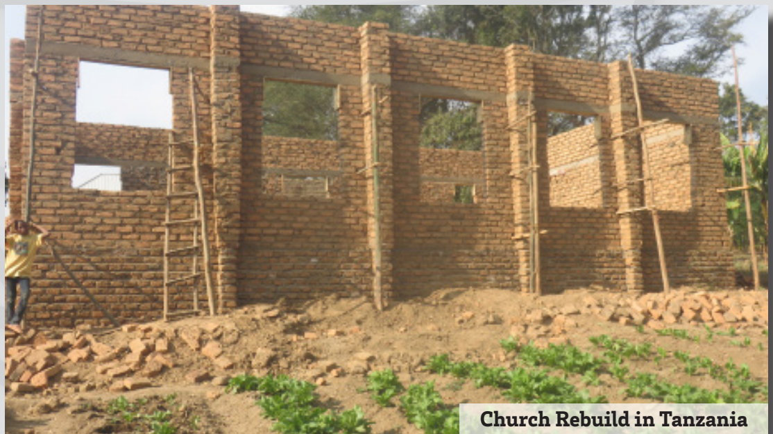
Church Rebuild in Tanzania