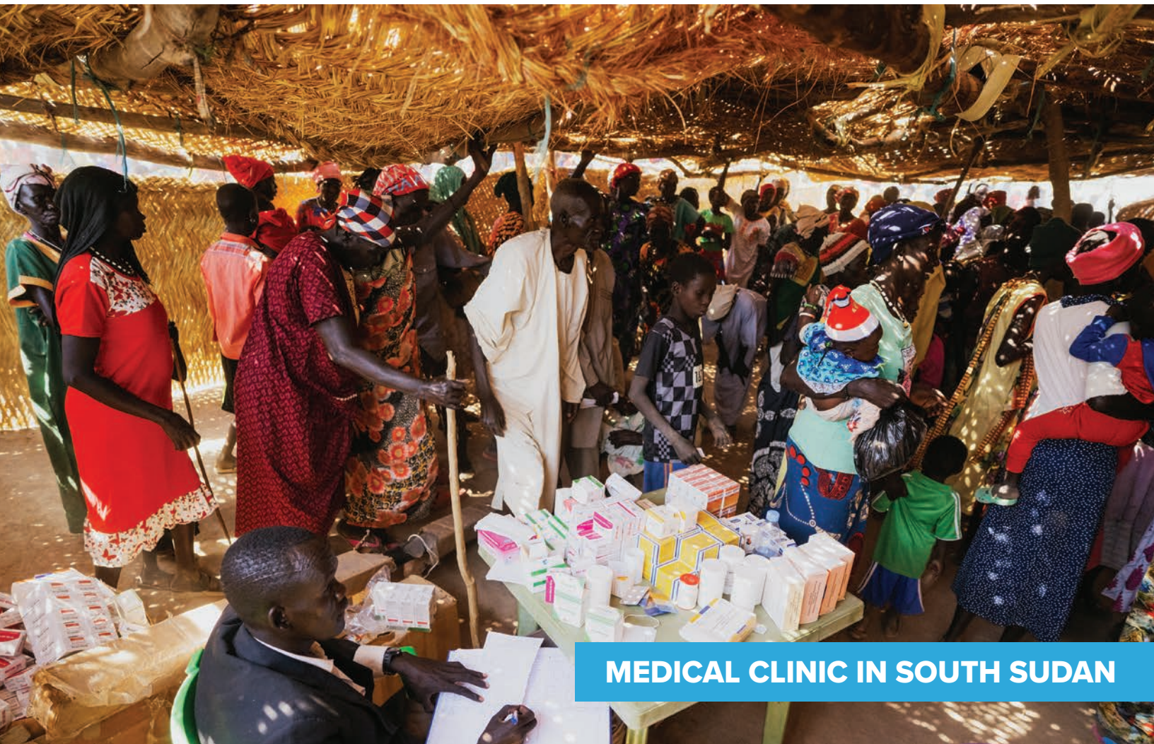
MEDICAL CLINIC IN SOUTH SUDAN

International Disaster Emergency Service 355 Park 32 West Dr. Noblesville, IN 46062-9218 Temporary Return Service Requested