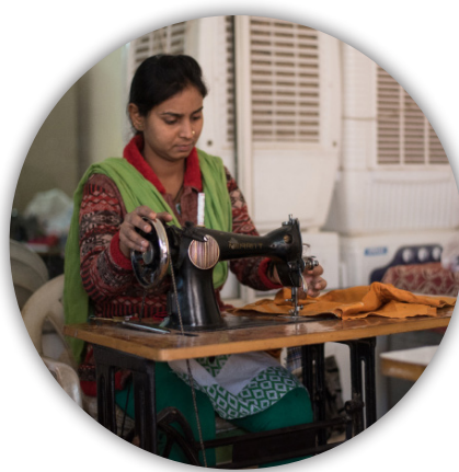
Dv10 - Sewing Machine

Chickens and other animals provide a sustainable source of food and income.