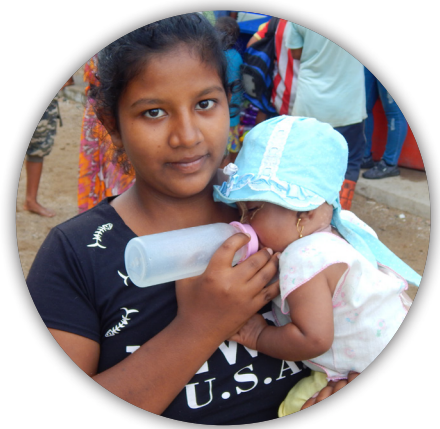
M8 - Infant Care Supplies

Mosquito nets are essential for preventing Malaria and other insect-borne illnesses.