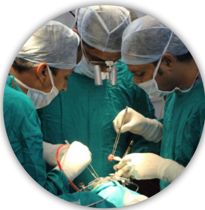
M1 - Cleft Lip / Palate Surgery

Corrective surgery provides children with this birth defect a chance at normal eating and speaking.