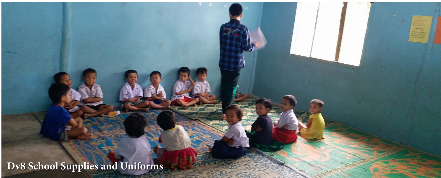
Dv8 School Supplies and Uniforms

Featured here is a school located in the heart of what is known as “Trash Dump Village.” With IDES help, the school has received new equipment including tables, chairs, desks, electric fans, and mosquito nets to ensure their 140 students receive a needed education and aren’t at risk of insect transmitted diseases that are rampant in the area.