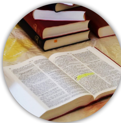
E1 - Bible

Motorbikes are vital for local church leaders and evangelists to travel efficiently between villages.