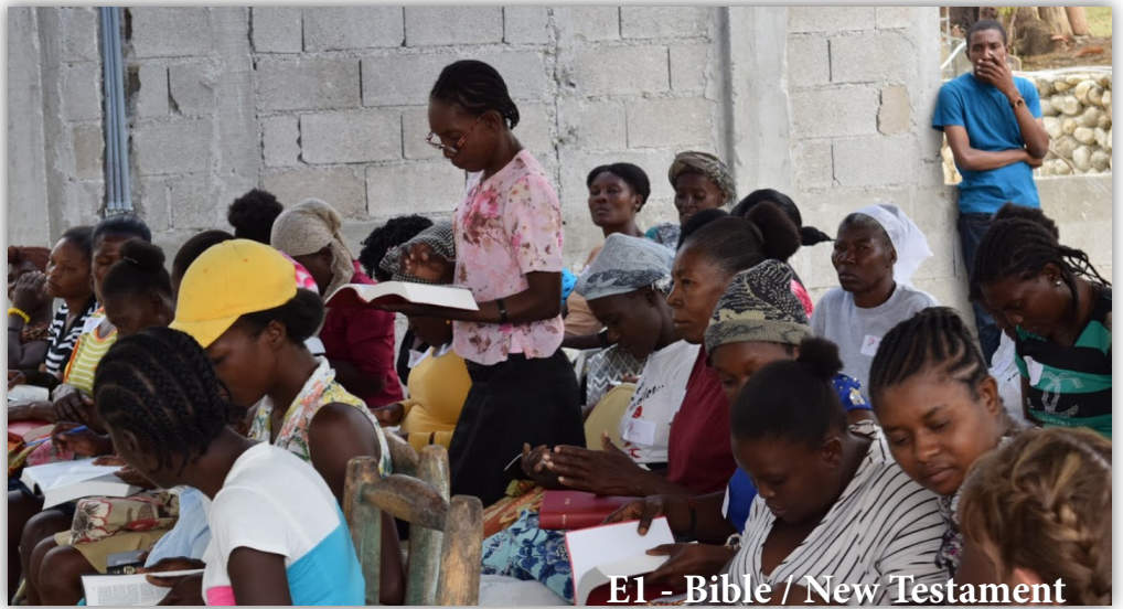
E1 - Bible / New Testament

This past spring, IDES was privileged to be part of the spiritual growth in 80 women and 110 girls all of whom attended Homeland Christian Church's first annual Women of Worth conference in Jacmel, Haiti. With your donation, these women were provided Bibles translated in their native language, Creole. Many of the attendees were inspired to share the message they had received with women who could not attend.