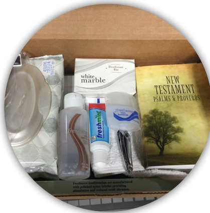
D7 - Personal Care Kit

Displaced families are in dire need of emergency food, water, clothing, blankets, and other items.