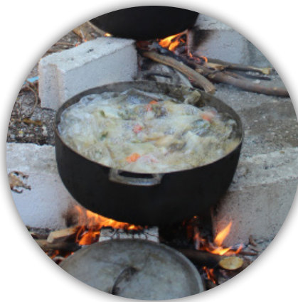
H1 - Cooking Pot

Rice is a staple food in the majority of diets around the world, and it is more affordable to purchase in bulk.