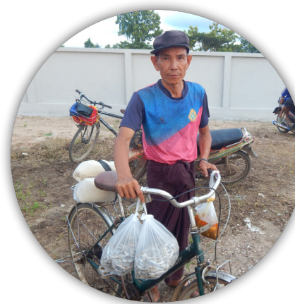
Dv21 - Bicycle

Sewing machines and other tools equip individuals to earn their own income.