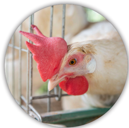
Dv4 - Chicken

Featured here is a school located in the heart of what is known as “Trash Dump Village.” With IDES help, the school has received new equipment including tables, chairs, desks, electric fans, and mosquito nets to ensure their 140 students receive a needed education and aren’t at risk of insect transmitted diseases that are rampant in the area.