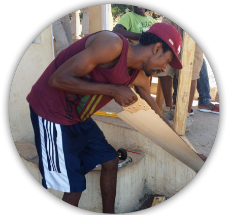
D2 - Tools

Personal Care Kits provide much needed daily accessories after a disaster and even the Word of God.