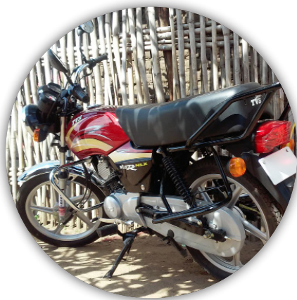
E4 - Motorbike

Motorbikes are vital for local church leaders and evangelists to travel efficiently between villages.