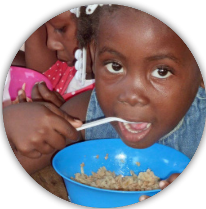
H4 - Rice (100 lbs)

Rice is a staple food in the majority of diets around the world, and it is more affordable to purchase in bulk.