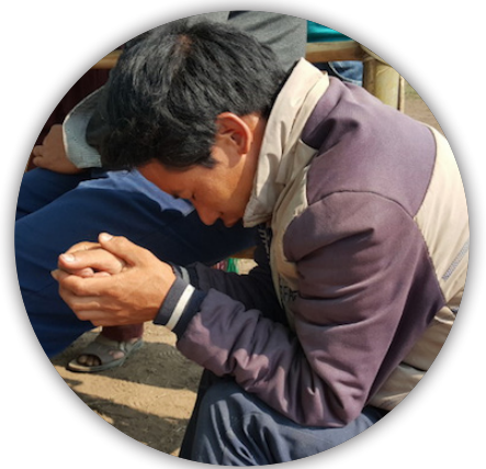
E7 - Leadership Training

Bibles are used to spread the Gospel of Jesus Christ to those who may have never heard of His love.