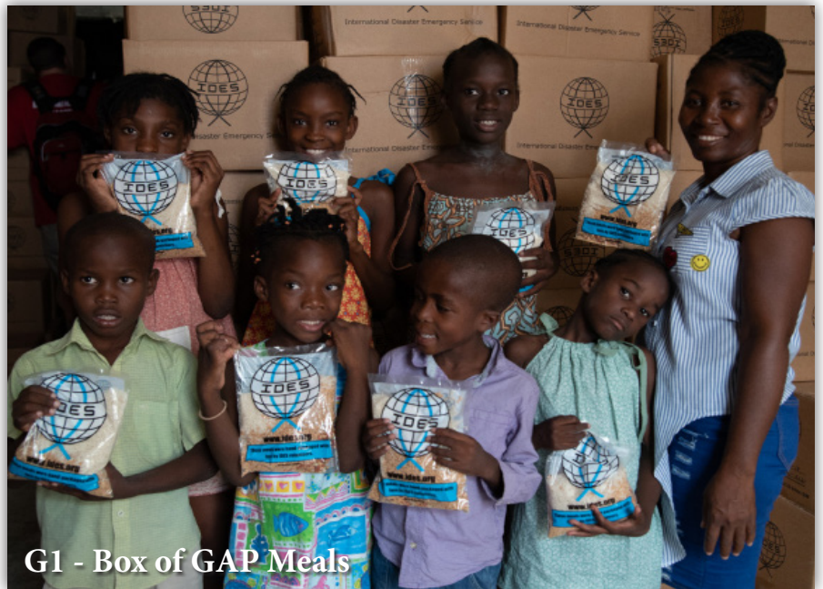
G1 - Box of GAP Meals

Hope for Haiti's Children has been an IDES partner for over five years. IDES has given GAP meals that are packed by volunteers in the U.S. at churches or at our Noblesville headquarters. Hope For Haiti's Children uses these meals to feed hungry children at their orphanages and schools. For most of these children, the meal they receive from IDES will be the only meal they will have all day. A lot of these children also walk long distances from a mountain region just to get to school and eat a meal.