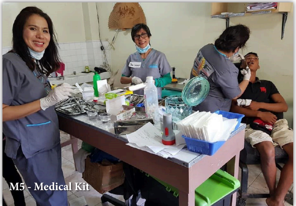
M5 - Medical Kit

Due to the lack of medical care and low income, many Indonesian families lose loved ones to preventable and treatable illnesses such as asthma, diabetes, pneumonia, and common infections. With IDES help, our partners at Harvest of Christ foundation are able to serve those in need at medical camps where they are treated and provided meals and bibles to help expand His kingdom.