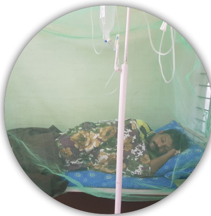
M7 - Mosquito Net

Corrective surgery provides children with this birth defect a chance at normal eating and speaking.