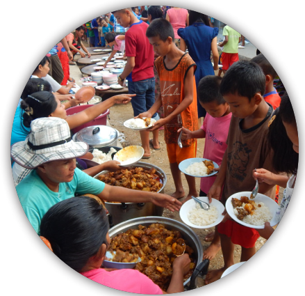
H5 - Family Portion

Every kitchen needs pots and pans, an essential tool for preparing / serving food.