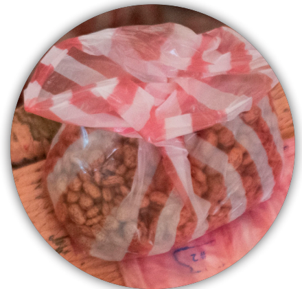
H2 - Beans

GAP meals provide much needed nutrition to those who may only eat one meal a day.