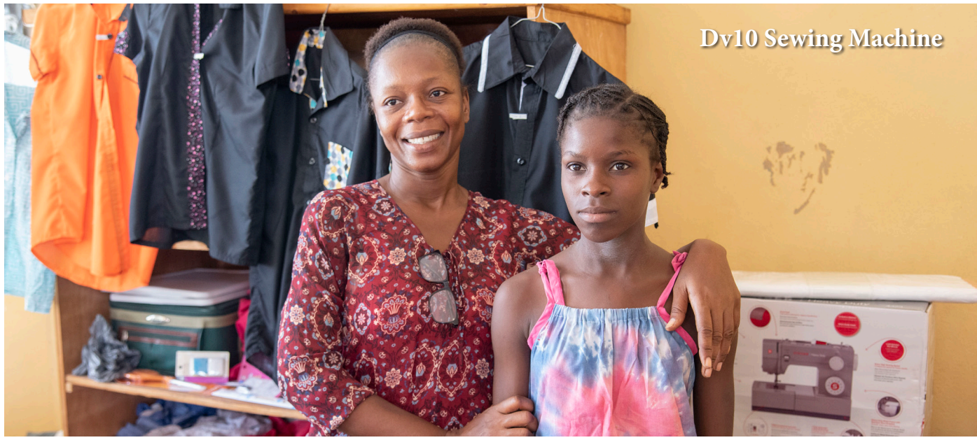
Dv10 Sewing Machine

Community Development projects address a wide variety of needs. What all IDES' development projects have in common, is the potential to create a better & brighter future for those who are helped. Your gifts will provide continued relief through the blessings of livestock, agriculture, clean water, education, vocational empowerment, and much, much more.