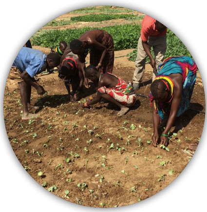
Dv1 - Seeds

Community Development projects address a wide variety of needs. What all IDES' development projects have in common, is the potential to create a better & brighter future for those who are helped. Your gifts will provide continued relief through the blessings of livestock, agriculture, clean water, education, vocational empowerment, and much, much more.