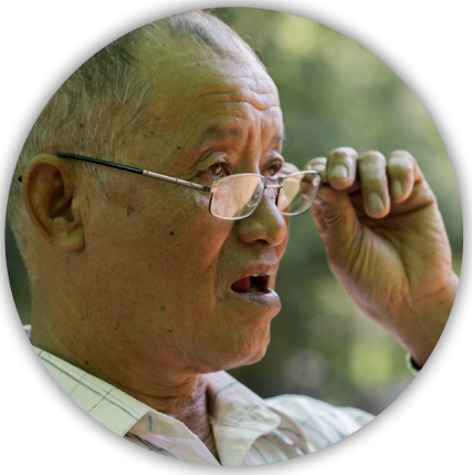
M2 - Eyeglasses

Eyeglasses help people to have clear vision, making their living conditions safer.