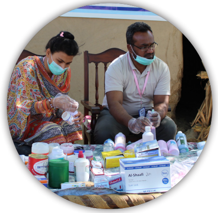
M5 - Medical Kit

Medications help those suffering from illness in countries where medicine is scarce.