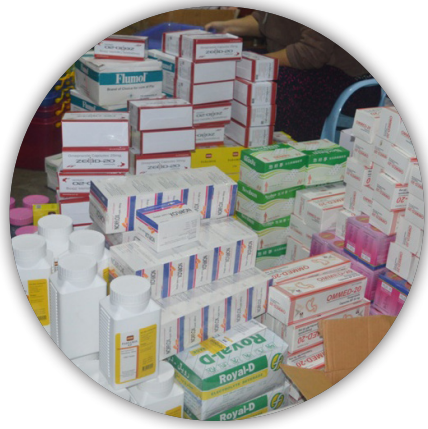
M3 - Medications

Eyeglasses help people to have clear vision, making their living conditions safer.