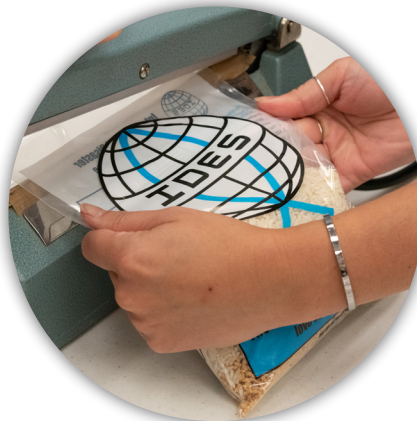
G2 - Bag of GAP Meals (6 servings)

Rice is a staple food in the majority of diets around the world, and it is more affordable to purchase in bulk.