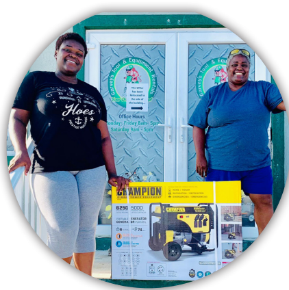
D10 - Generator

A water purification kits provides clean drinking in communities where waters sources can have contaminates.