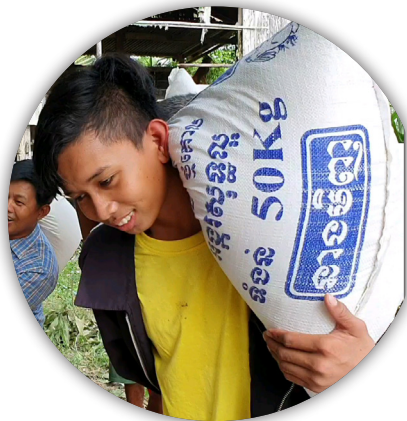
H4 - Rice (100 lbs)

Rice is a staple food in the majority of diets around the world, and it is more affordable to purchase in bulk.