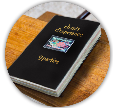
E3 - Song Book

Christian leaders around the world are encouraged and equipped by effective leadership training and materials.