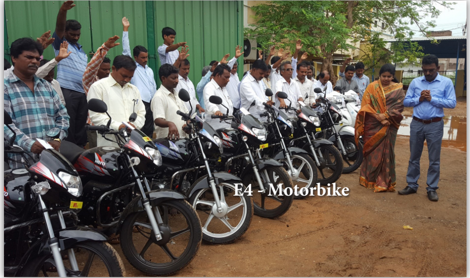
E4 - Motorbike

Evangelism is IDES' most important focus area. We seek not simply to meet the urgent needs of today, but to share the eternal love and hope which Jesus Christ offers to all who seek Him. The gift items below are important tools and resources our global partners will gratefully use, as they offer help and hope to our hurting world.