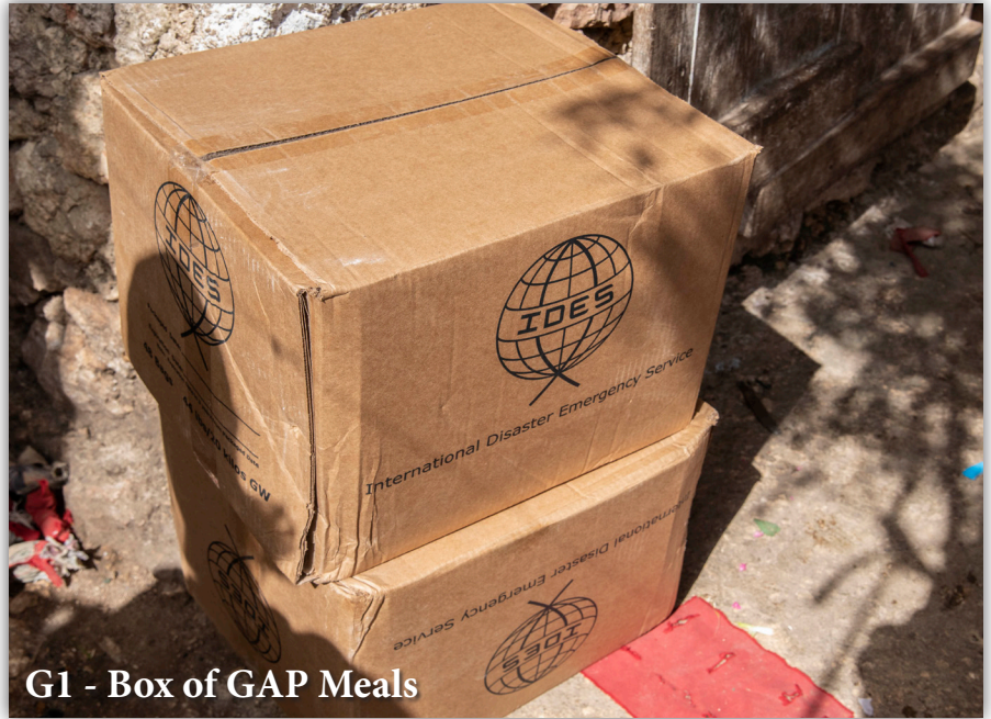
G1 - Box of GAP Meals

Around the world, one out of nine people face chronic hunger. IDES' Hunger Relief efforts seek to address this urgent need in the precious name of Jesus. Hunger can result from drought or storms, pests or plant diseases, conflict or persecution. The most common cause of hunger is simply poverty. Whatever the cause, IDES' response is the same; we offer immediate help and eternal hope to those who hunger.