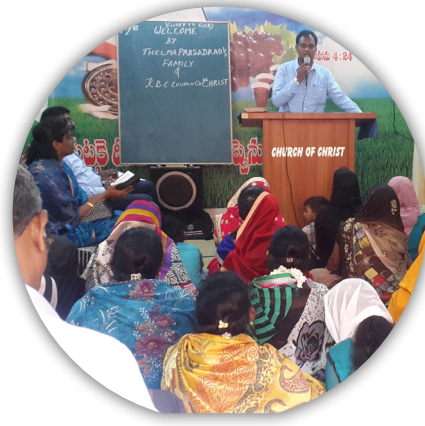
E7 - Leadership Training

Bibles are used to spread the Gospel of Jesus Christ to those who may have never heard of His love.