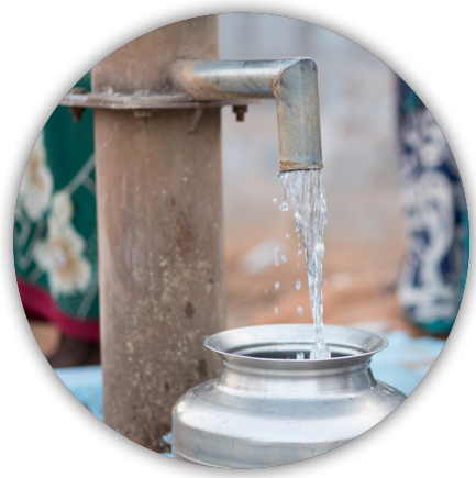
Dv15 - Clean Water Well (or a portion for $25, $250)

Cows/Water Buffalos aid farmers as they sustain the products they produce.