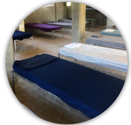
D1 - Blanket/Bedding

Generators provide power to homes affected by disasters.