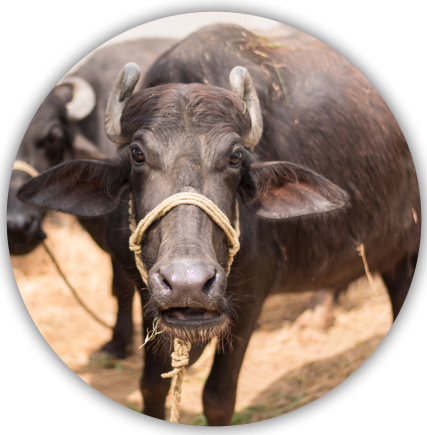
Dv6 - Cow/Water Buffalo (or a portion for $60)

Seeds are provided and planted in areas that have been affected by drought.