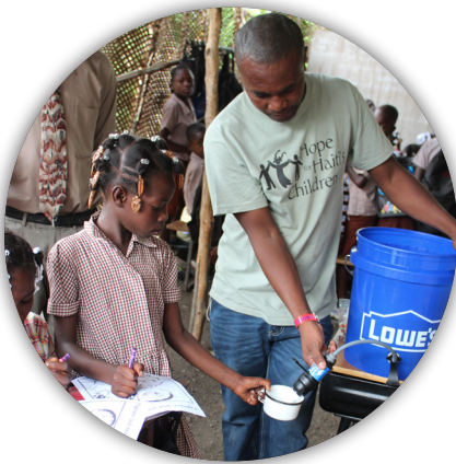
D6- Water Purification Kit

A water purification kits provides clean drinking in communities where waters sources can have contaminates.