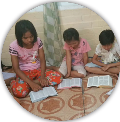
E1 - Bible/New Testament

Bibles are used to spread the Gospel of Jesus Christ to those who may have never heard of His love.