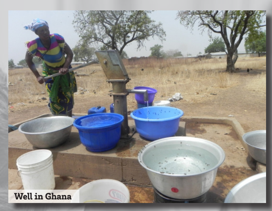
25 Community Development Projects in 15 Nations