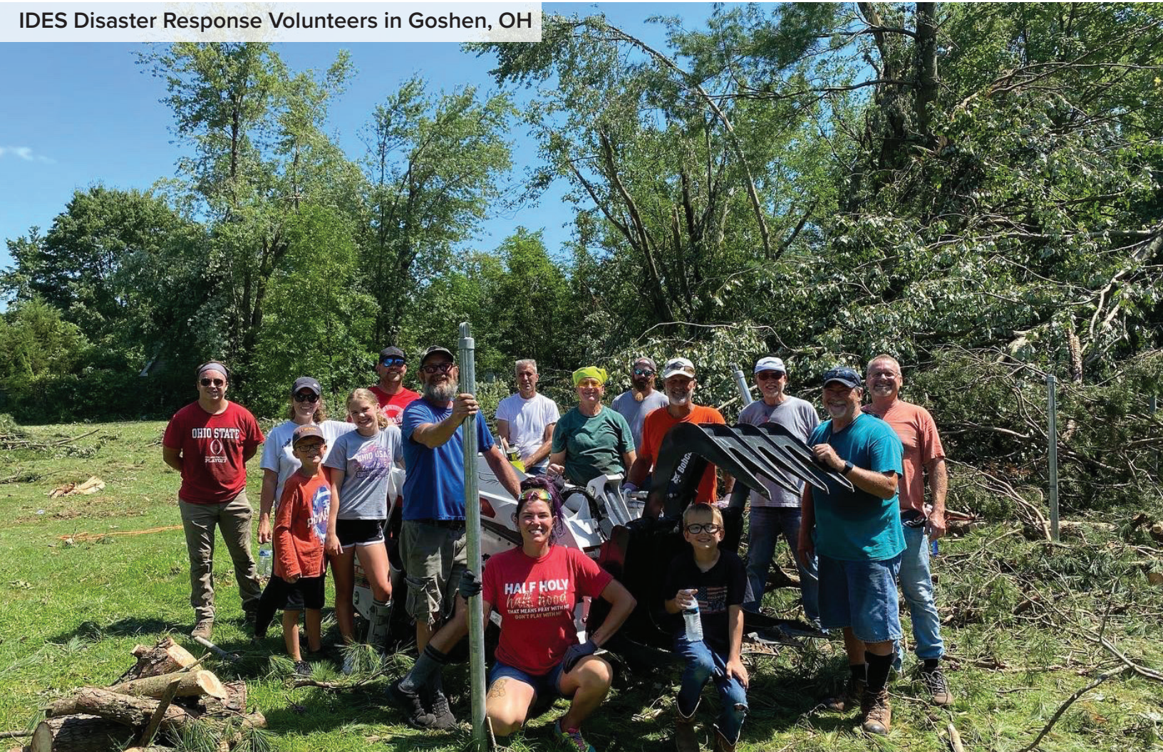
IDES Disaster Response Volunteers in Goshen, OH

International Disaster Emergency Service 355 Park 32 West Dr. Noblesville, IN 46062-9218 Temporary Return Service Requested