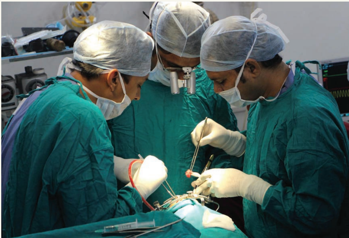
M1: Cleft Lip/Palate Surgery - $300