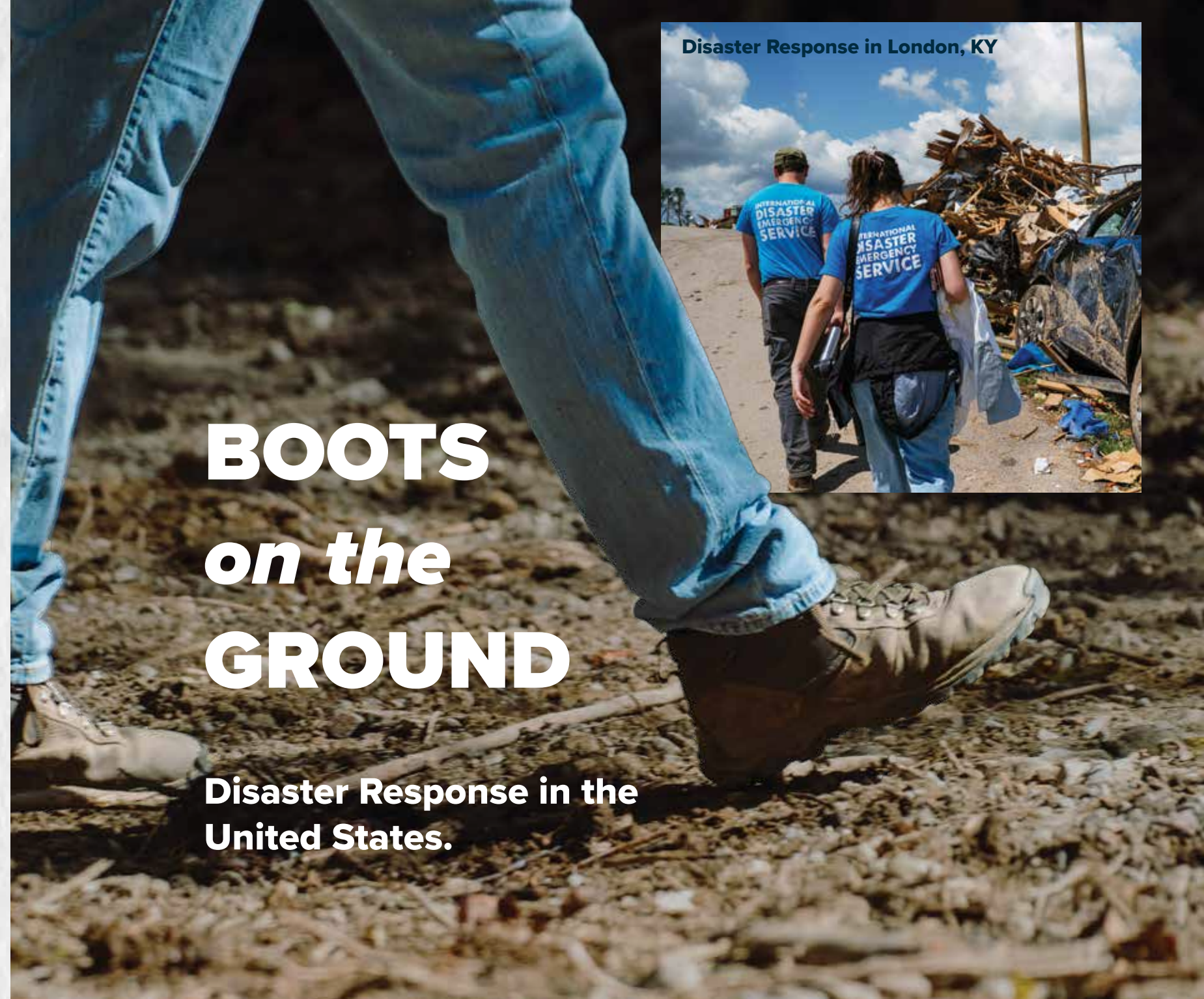
Disaster Response in London, KY