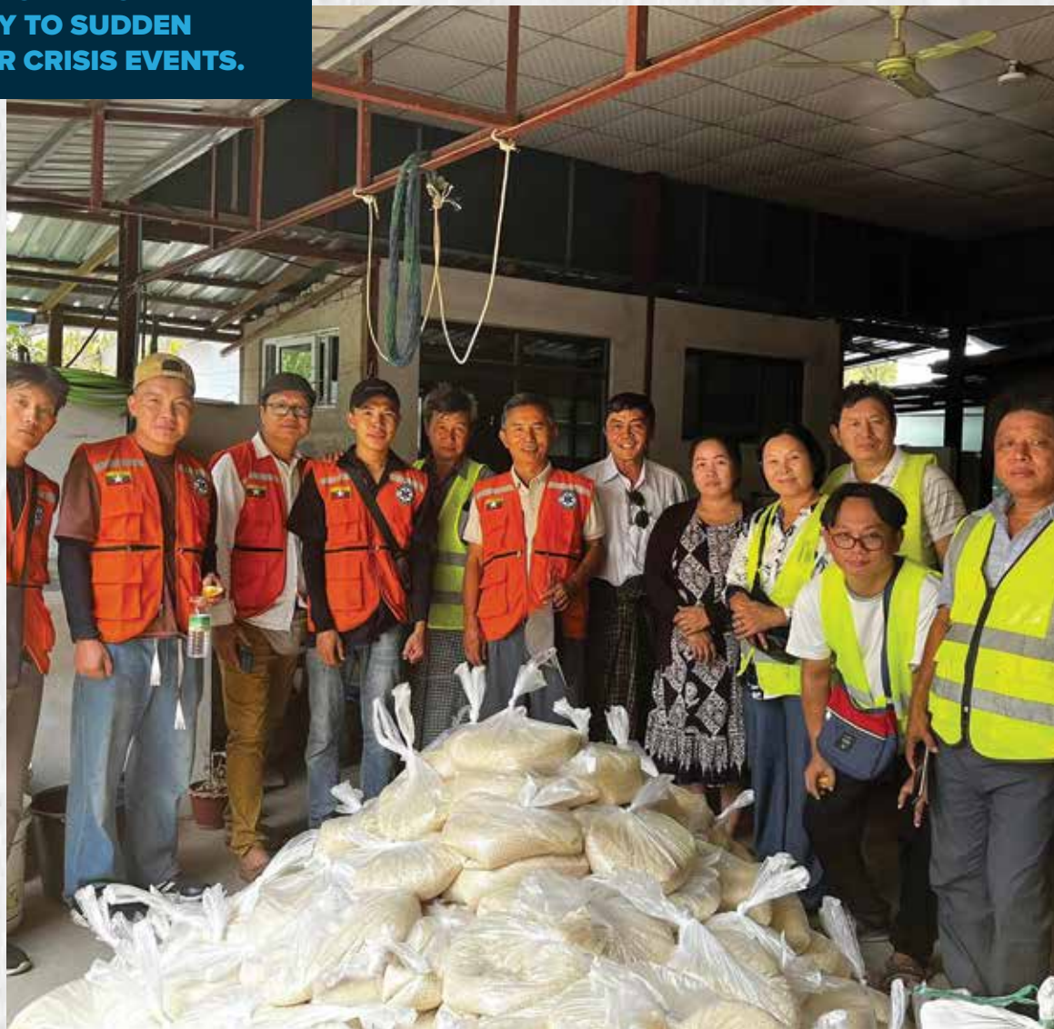
Earthquake Relief in Myanmar

Our partners have not only provided physical needs, but they have also met spiritual needs through prayer and sharing Christ's love in extreme conditions. Please continue to pray for our partners and those who are recovering from this earthquake and for opportunities to share the Hope and Love of Jesus.