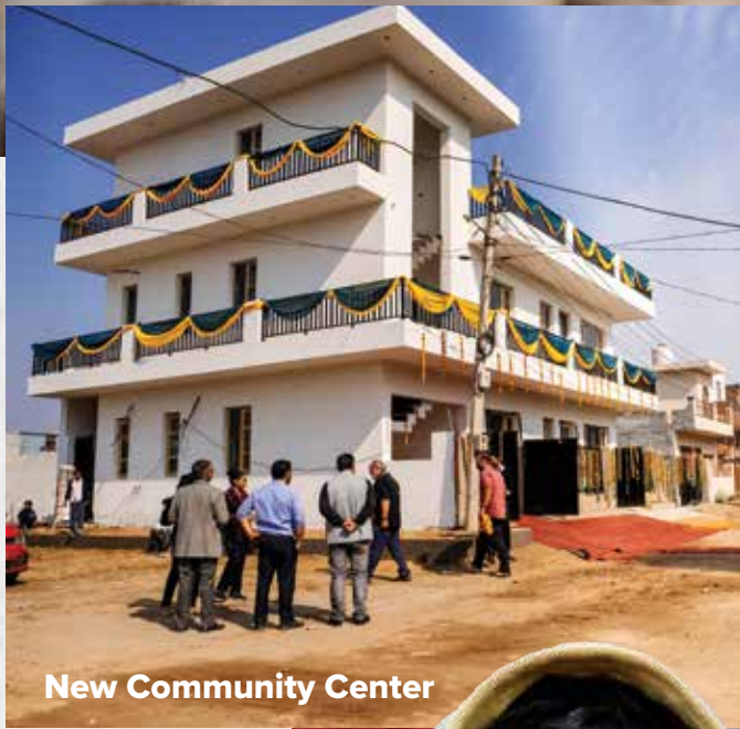
New Community Center

This year we celebrated the grand opening of a partner's new "community center." This building is so much more than just a pretty structure— it's a tool that will enable our partners to help even more people. Talking with our partners, they don't just see a bigger space— they see more people fed, more children educated, more lepers cared for, more women supported, more families ministered to, and more people given the incredible hope that there is a God who loves them.