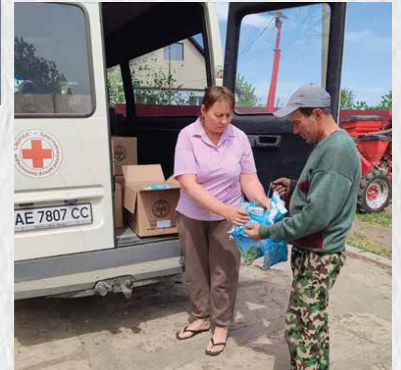
GAP Meals Distributed in Ukraine