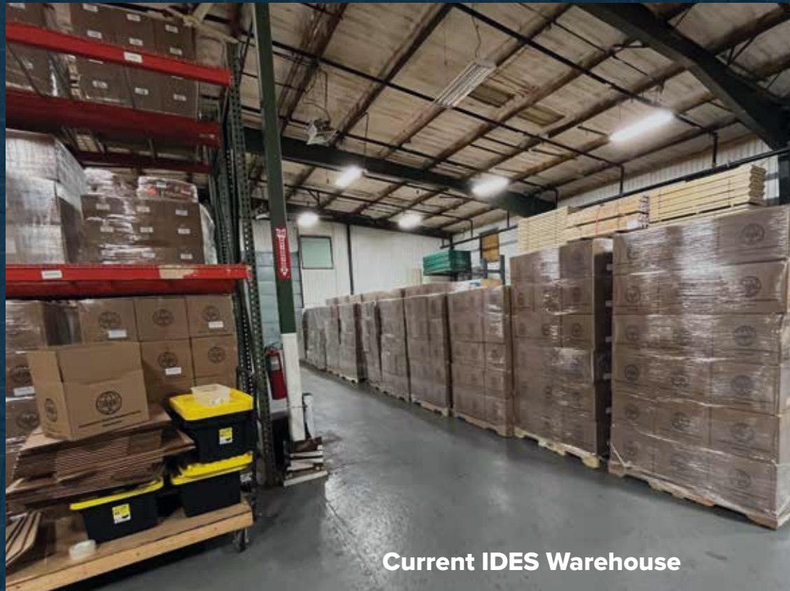
Current IDES Warehouse

6.3 million dollars feels like an incredible hurdle to reach the completion of this building campaign, but we have seen God bring us this far and we trust that he will keep providing the support and finances as we proceed with this building campaign, just as he has done with every event that has led us to this point. We look forward to the completion of this project and the unbelievable, exponential, positive change it will bring. It is our deep hope that you will support us by joining in the cycle of prayer that is infused in our everyday lives at IDES and, therefore, in this building campaign as well. When the Global Impact Center is completed, we believe it will give us even more opportunities to share Help & Hope, and we'll keep praying through all of it!