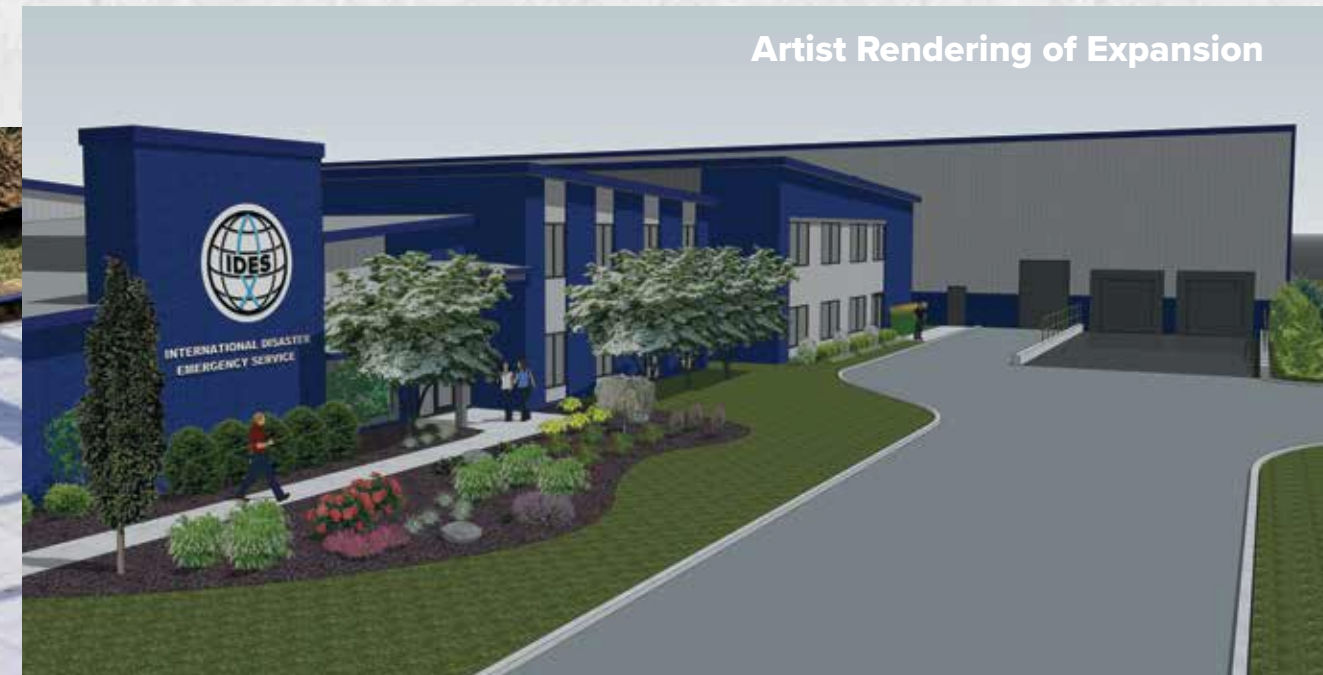
Artist Rendering of Expansion