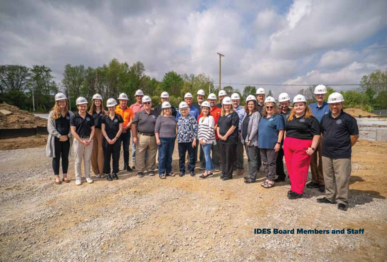
IDES Board Members and Staff

International Disaster Emergency Service 355 Park 32 West Dr. Noblesville, IN 46062-9218 Temporary Return Service Requested