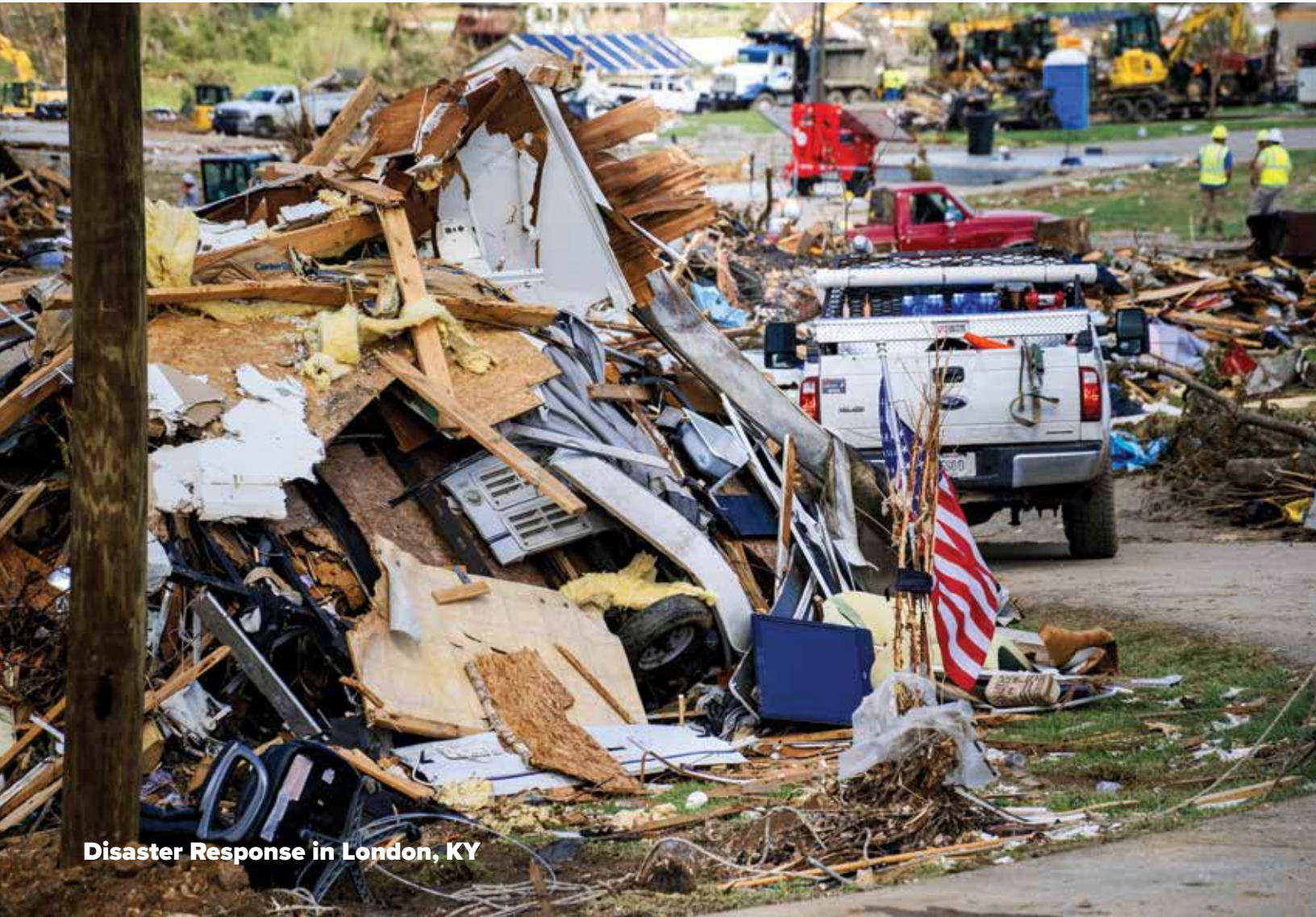
Disaster Response in London, KY

Non-Profit Org. U.S. Postage PAID Noblesville, IN Permit #19